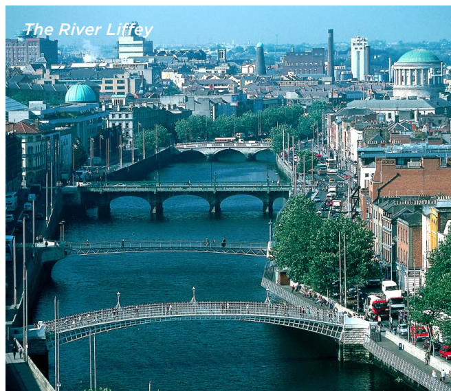
The River Liffey

INSOL Europe shall not be responsible for, and shall be exempt from, all liability in respect of any loss, damage, injury, accident, delay or inconvenience to any person during the Congress. It is the delegate's and accompanying person's responsibility to be adequately insured in case of claims pertaining to travel/accidents for the duration of their visit.