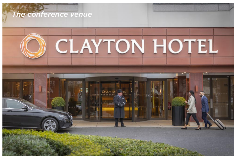
The conference venue

By Car: Private transfers can be arranged from Dublin Airport via our agent Una Miley (email: una@atoi.ie ). Alternatively, a taxi from